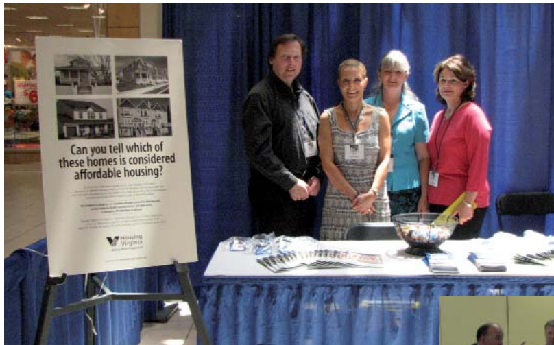
Local REALTORS® educate the public at the Affordable Housing Resource Fair.

interesting challenges facing individuals and families trying to secure quality, affordable housing. In many cases, it is not the cost of the monthly mortgage payment that prevents a purchase but rather poor credit history and too much debt. In some areas of the region, a major shortage of rental housing has driven prices up making many options unaffordable. In some other parts of the region, the price of land has made it nearly impossible for new home construction to be affordable. All of the information gathered at the forums will be analyzed to identify common trends facing our communities and any potential solutions that could be implemented.