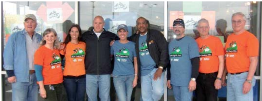
FAAR Volunteers are all smiles at Habitat's RideVA fundraiser.

Habitat also operates Restore at 4755 Jefferson Davis Highway, Fredericksburg, VA 22408. The store collects donations of used furniture, appliances, surplus building sup-